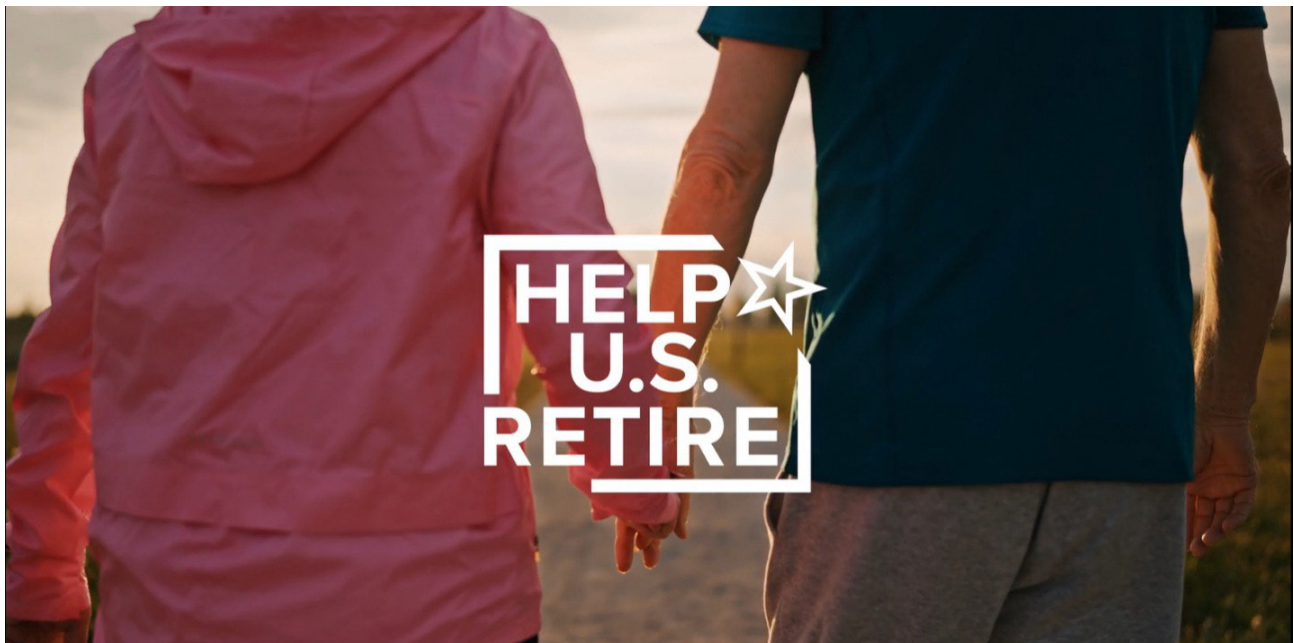
Help U.S. Retire campaign ad, currently airing on CNBC